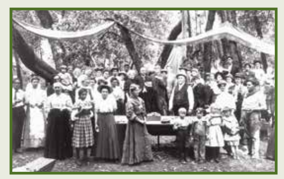
Sempervirens Club annual meeting, ca. 1915