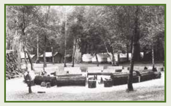
Campfire benches and tents, ca. 1915