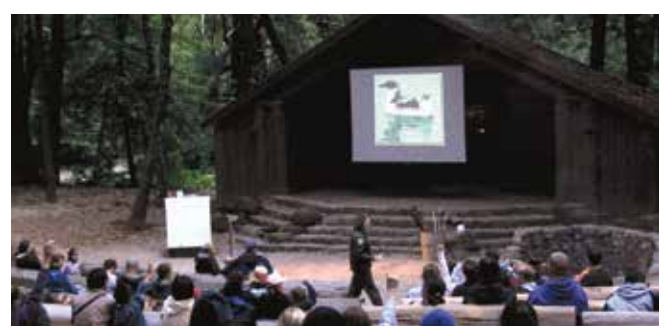
Interpretive programs at the campfire center

Camping —146 family campsites, four group camping sites, tent cabins, backcountry trail camps, and horse camping are available. For complete camping options and reservations, visit www.parks.ca.gov/bigbasin or call (800) 444-7275. For reservations to the