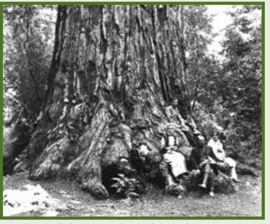
Father of the Forest redwood, ca. 1915