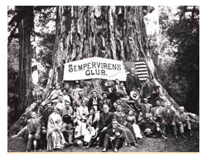
Sempervirens Club with the famous Father of the Forest tree, 1901

The name Sequoia may honor Sequoyah, the 19th-century inventor of the Cherokee alphabet, and sempervirens means "ever living." These trees are part of a once-huge ancient forest of which less than 5 percent remains. The redwood is California's official state tree.