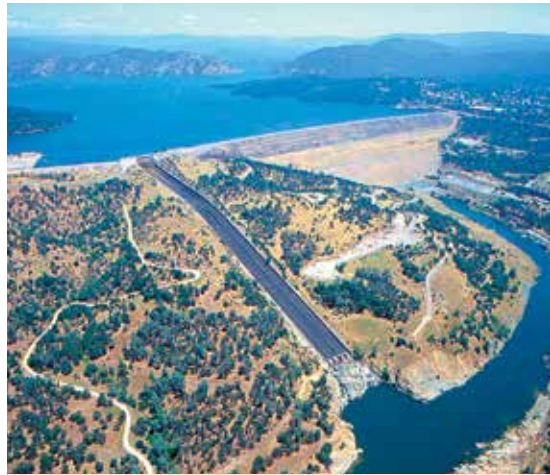
Aerial view of Oroville Dam

Feather River was found to be rich in gold, entrepreneurs and gold seekers flooded into the area, taking Maidu land and establishing several small mining towns. Most towns are now under the lake. A tent city named Ophir ("gold" in Hebrew) became the present city of Oroville. The newcomers also brought diseases to which the native people had no resistance, so their numbers dwindled. Today many Maidu people live on local rancherias, including those at Oroville and Chico.