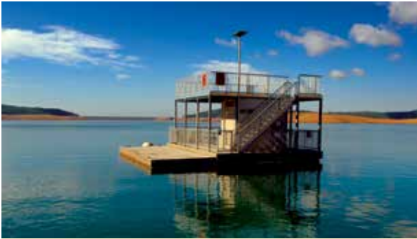
One of the lake's floating campsites

Loafer Creek —137 sites at the Coyote Campground can accommodate tents or trailers up to 31 feet and campers or motorhomes up to 40 feet (no hookups). Drinking water and restrooms, coin-operated showers, laundry tubs, and a launch ramp are