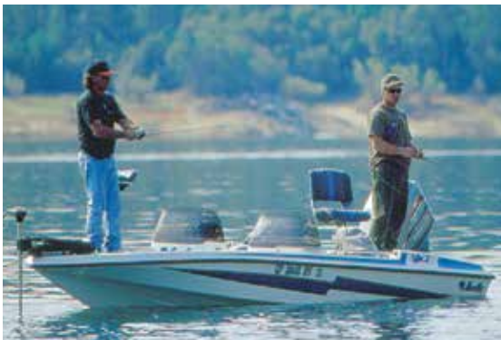
The fishing is great year-round.

At the fish hatchery building across the street, artificial spawning takes place in the