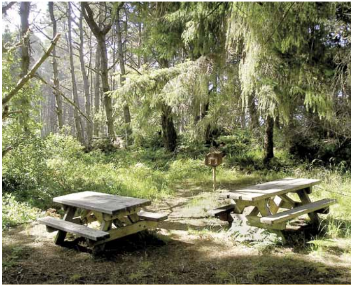
Fisk Mill picnic area

Picnicking —Fisk Mill Cove, a day-use area with paved parking, picnic tables, upright barbecues, restrooms and drinking water, is shielded from the wind by Bishop pines. For a dramatic view of the Pacific Ocean, take a short walk from the north parking lot to Sentinel Rock’s viewing platform. Stump Beach, one of the few sandy beaches north of Jenner, has some picnic tables near the parking lot and a primitive toilet, but no running water. A 1/4-mile trail leads to the beach. Gerstle Cove also has picnic tables, a primitive toilet and a scenic view of the ocean.