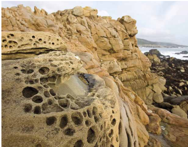
Tafoni formations in sandstone

Diving —Salt Point's rocky coastline attracts abalone divers. Abalone collection is highly regulated. People taking abalone need a valid California fishing license and abalone report card. Additional rules apply regarding minimum size, daily bag and possession limits, tagging and reporting. For more information on abalone and fishing regulations, contact the Department of Fish and Game or visit www.dfg.ca.gov .