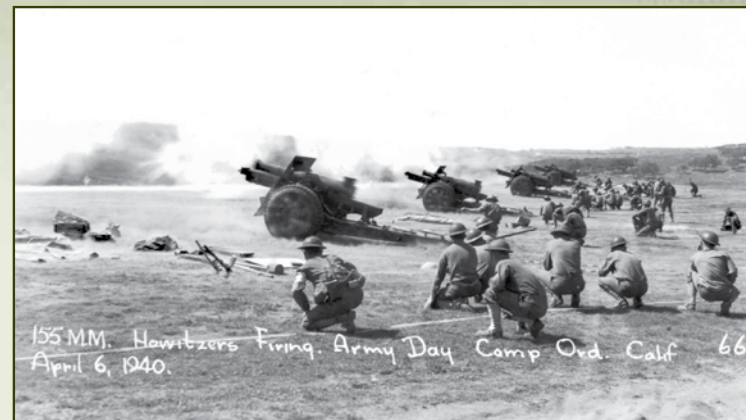
155 M.M. Howitzers Firing. Army Day Camp Ord. Calif 66 April 6, 1940.

During World War II, the Korean War and the Vietnam War, Fort Ord became a key troop processing and training center. More than 1,500,000 soldiers trained at Fort Ord between 1940 and 1973, when the Selective Service System's military draft ended. The 7th Infantry Division (Light) Army volunteers took over the base from 1974 until Fort Ord was decommissioned in September 1994. Several buildings were removed, and coastal dune habitat restoration began. The Army transferred 979 coastal acres of the 28,000-acre fort to California State Parks in 2009.