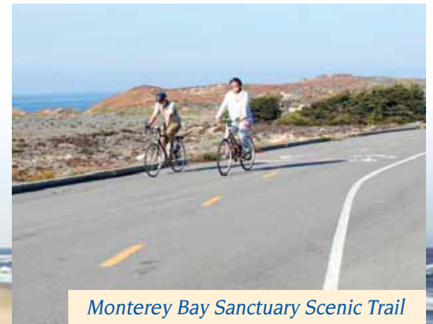
Monterey Bay Sanctuary Scenic Trail

Salinas River Mouth Natural Preserve and Salinas River Dunes Natural Preserve form a portion of this park. A mile of dune trail begins in two of the three parking lots, and it links two coastal access points.