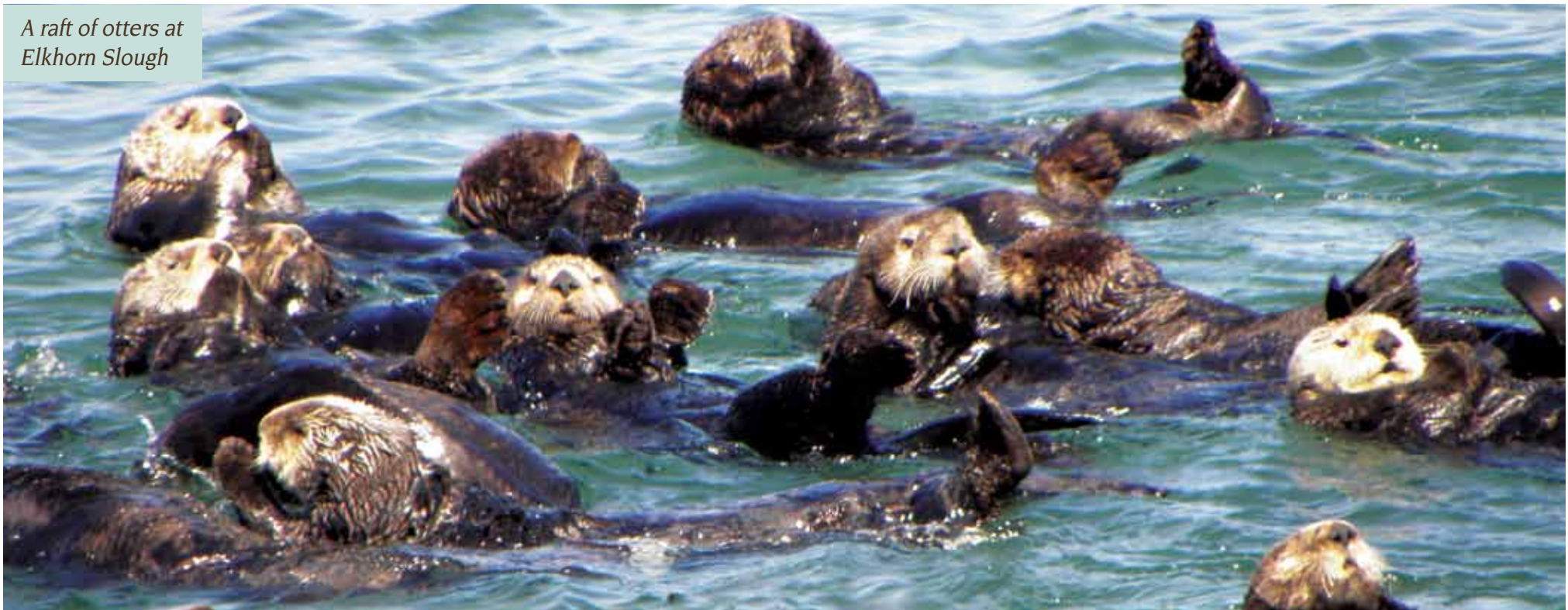
A raft of otters at Elkhorn Slough