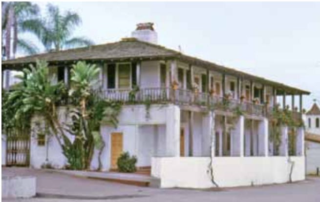
Bandini House in Old Town San Diego

Today the historic park reflects the cultural elements of its exciting and romantic past. Guided tours are available. For more information, call (619) 220-5422.