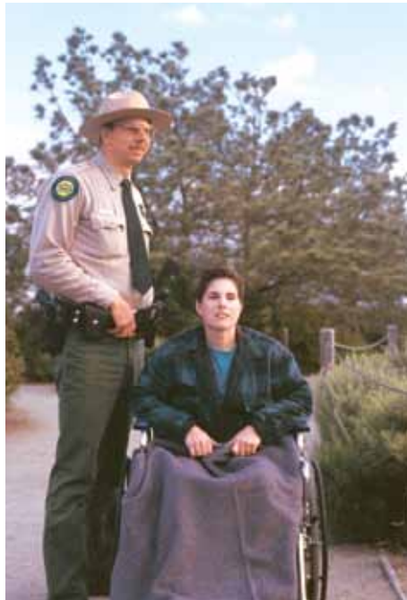
Torrey Pines State Natural Reserve

Torrey Pines State Natural Reserve is a jewel of the California State Park System. Named for the native pines growing on the bluffs, this park has natural splendor that is truly memorable. Seven miles of hiking trails offer