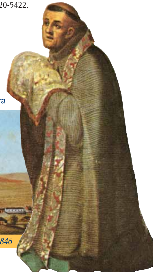
Father Junípero Serra