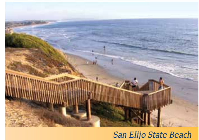
San Elijo State Beach

San Elijo State Beach, with two miles of coastline, is mainly a campground, but