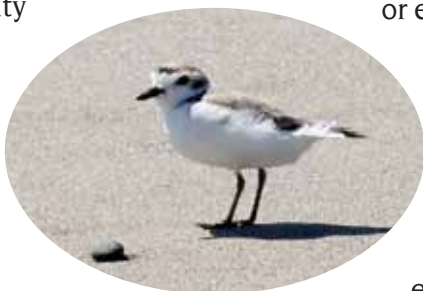
Endangered Western snowy plover