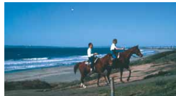
Border Field State Park