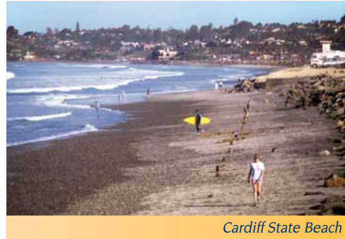
Cardiff State Beach

The park has 220 campsites and two day-use areas. Ponto Day-Use Area, south of the campground, has restroom