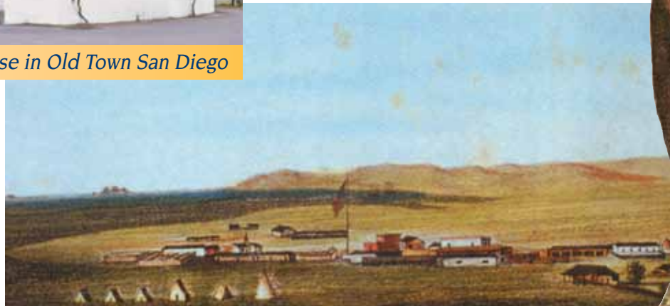
Painting of early San Diego by Lt. William H. Emory, 1846