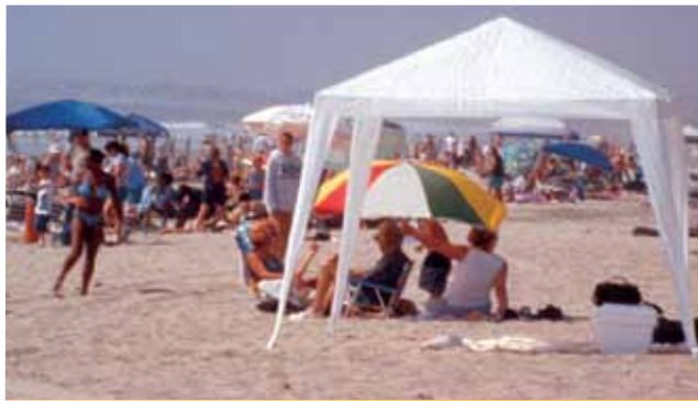
Silver Strand State Beach

RV campsites may be reserved by calling (800) 444-7275 or visiting www.parks.ca.gov .