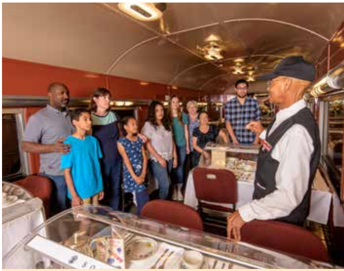
Dining car docent explains meal service.