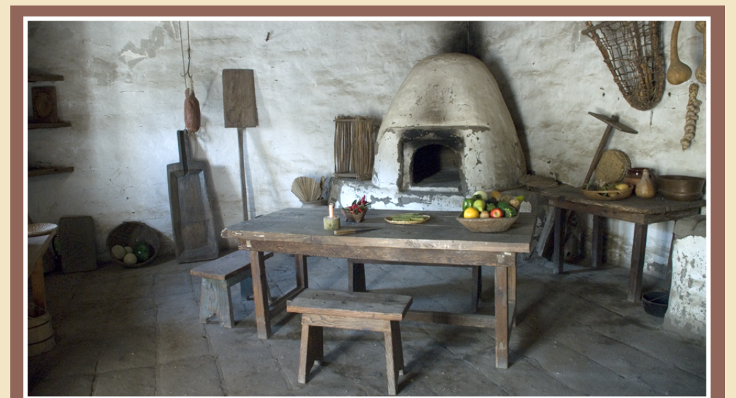
8 Pottery shop, Grist Mill and Kitchen