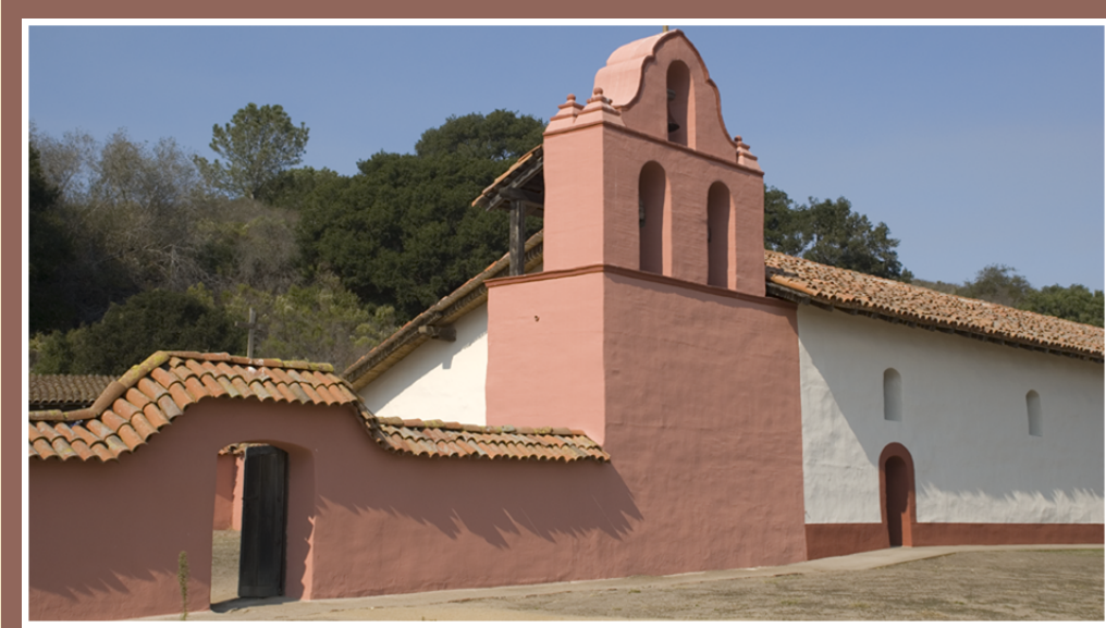
3 Cemetery, Bell Tower