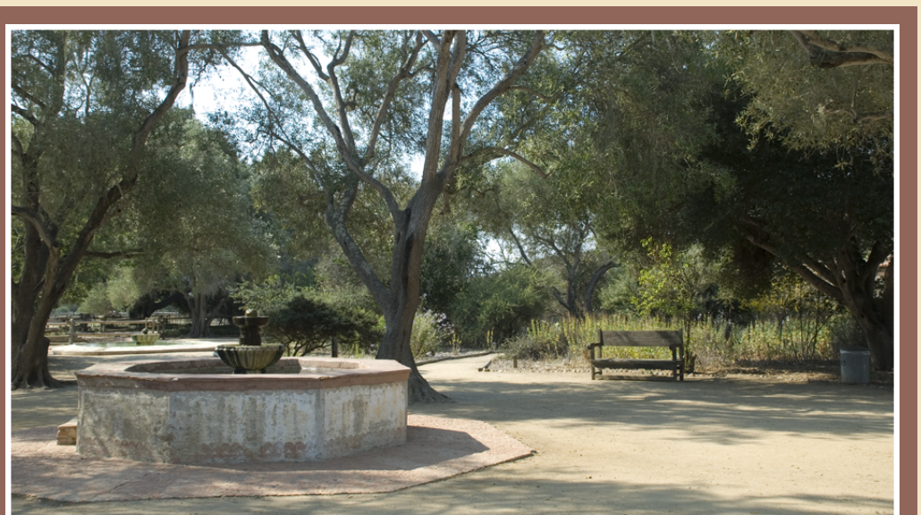
12 Mission Gardens