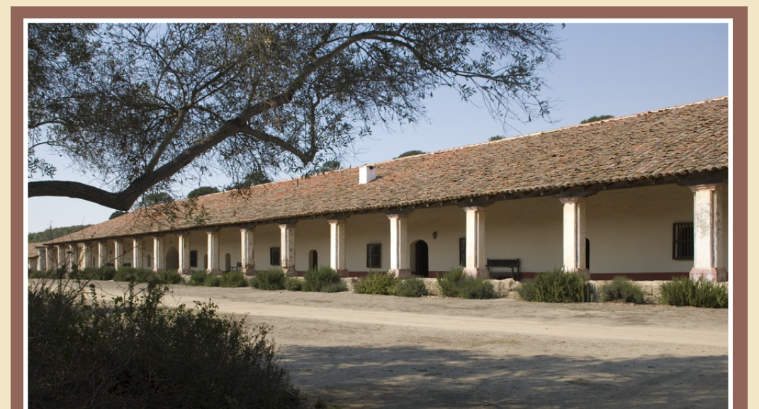
7 Residence Building