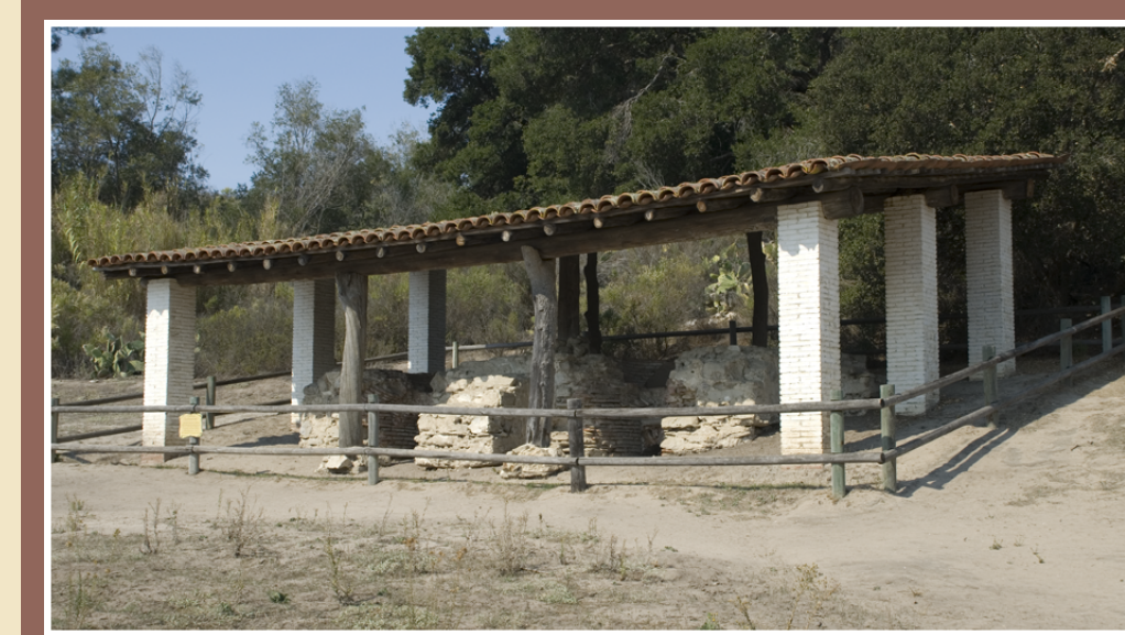
4 Tallow Vats