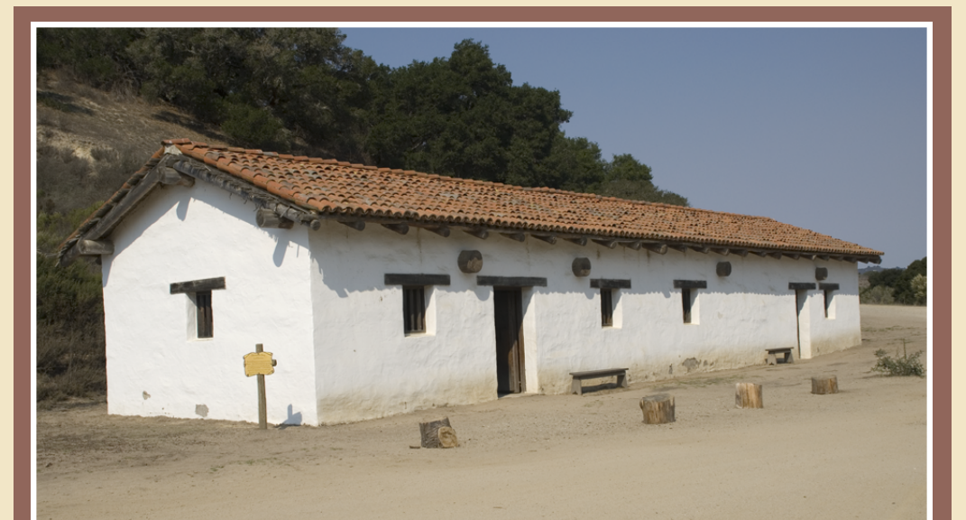
9 Blacksmith Shop