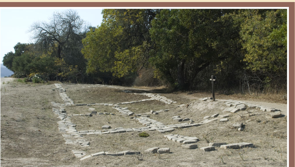
11 Indian Apartments