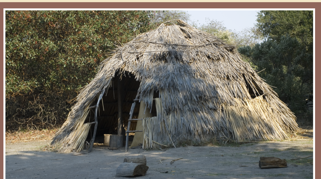
13 Tule Village