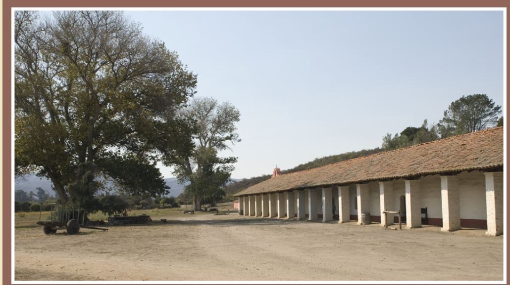
2 El Camino Real