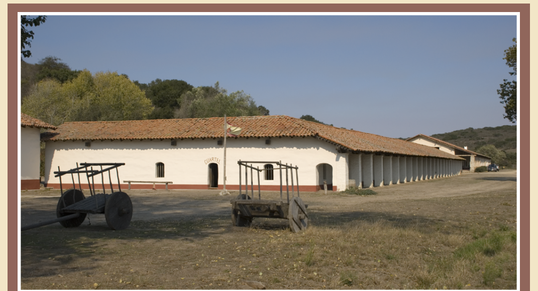
6 Shops and Quarters