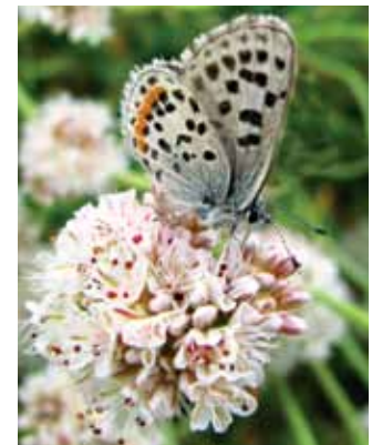
Smith's blue butterfly

Pelicans, grebes, Caspian terns and gulls fly over the sea, hoping to find such prey as surf perch, rockfish, squid and night smelt. Step carefully to avoid the nest of the western snowy plover, a small, threatened bird that blends into the beach sand.