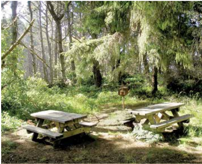
Fisk Mill Cove picnic area

Picnicking —Fisk Mill Cove, a day-use area with paved parking, picnic tables, upright barbecues, restrooms and drinking water, is shielded from the wind by Bishop pines. For a dramatic view of the Pacific Ocean, take a short walk from the north parking lot to Sentinel Rock’s viewing platform. Stump Beach, one of the few sandy beaches north of Jenner, has some picnic tables near the parking lot and a primitive toilet, but no running water. A ¼-mile trail leads to the beach. Gerstle Cove also has picnic tables, a primitive toilet and a scenic view of the ocean.