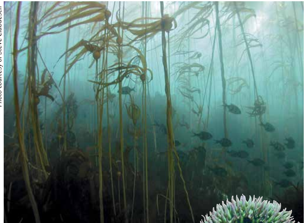
Marine life abounds in the waters off Salt Point. Above: bull kelp forest; right: anemone.