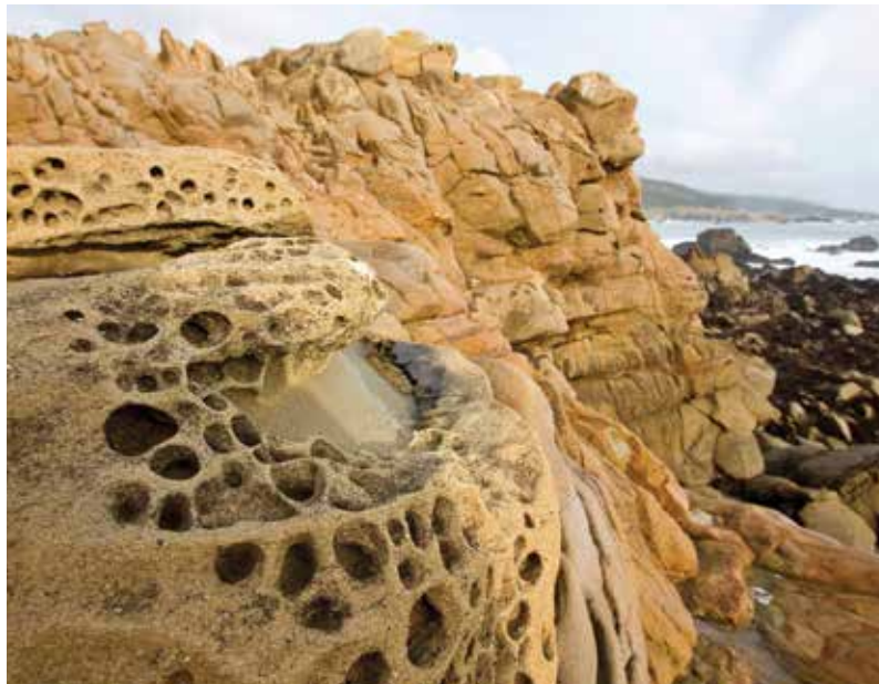
Tafoni formations in sandstone

Diving —Salt Point's rocky coastline attracts abalone divers. Abalone collection is highly regulated. People taking abalone need a valid California fishing license and abalone report card. Additional rules apply regarding minimum size, daily bag and possession limits, tagging and reporting. For more information on abalone and fishing regulations, contact the Department of Fish and Wildlife or visit www.wildlife.ca.gov .