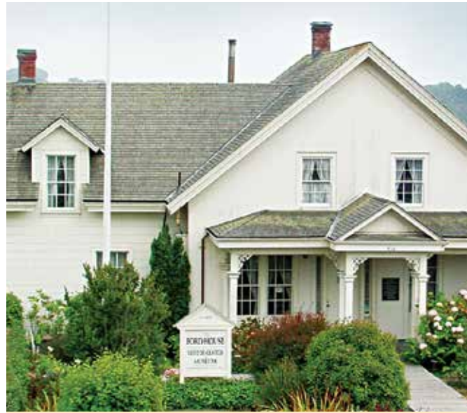
The Ford House Visitor Center

In 2002 California State Parks acquired 7,334 acres of land between Russian Gulch and Van Damme that begins near the Mendocino Headlands, where the Big River