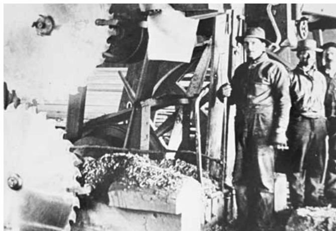
Van Damme sawmill

Van Damme habitats include marine, coastal beach, coastal bluff terrace, pygmy forest, redwood forest, and riparian, with