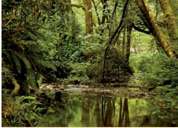
Little River, Van Damme State Park

The Pomo date back about 3,000 years on the North Coast. They built their main village of redwood bark houses at the mouth of Big River. The Pomo hunted large and small game, caught fish and shellfish, and gathered seaweed, acorns, and various seeds. Whatever they could not obtain locally, they acquired in trade with other groups; in times