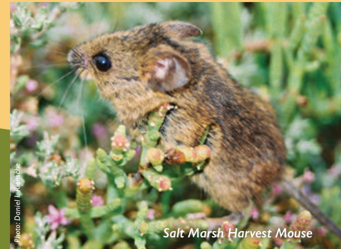
Salt Marsh Harvest Mouse