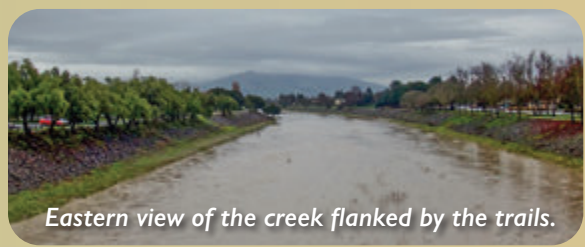
Eastern view of the creek flanked by the trails.