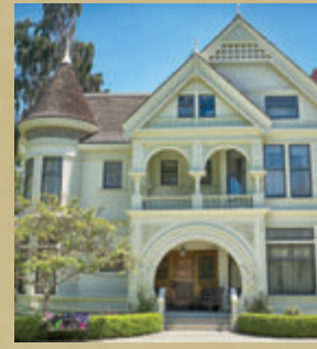
Patterson House tours