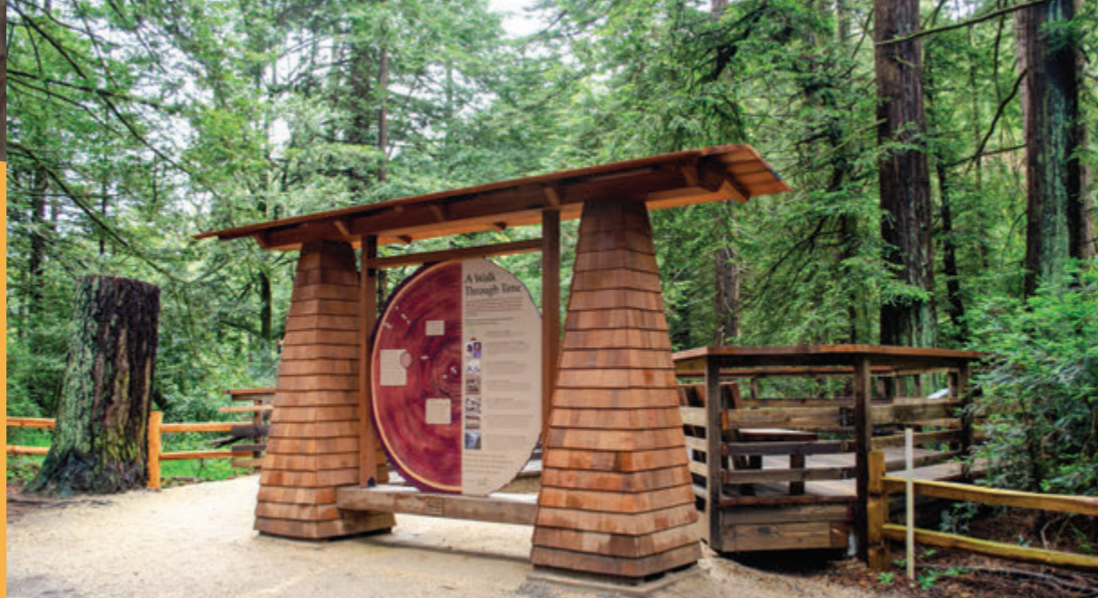
Old Growth Redwood Heritage Viewing Deck and Interpretive Exhibit