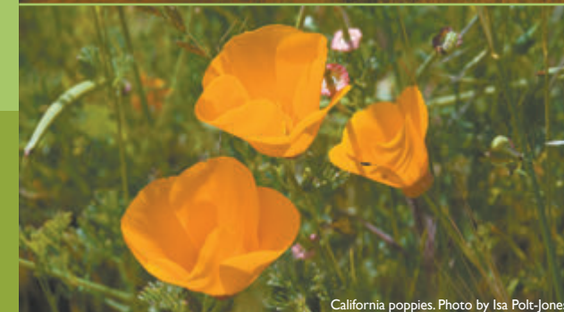
California poppies.