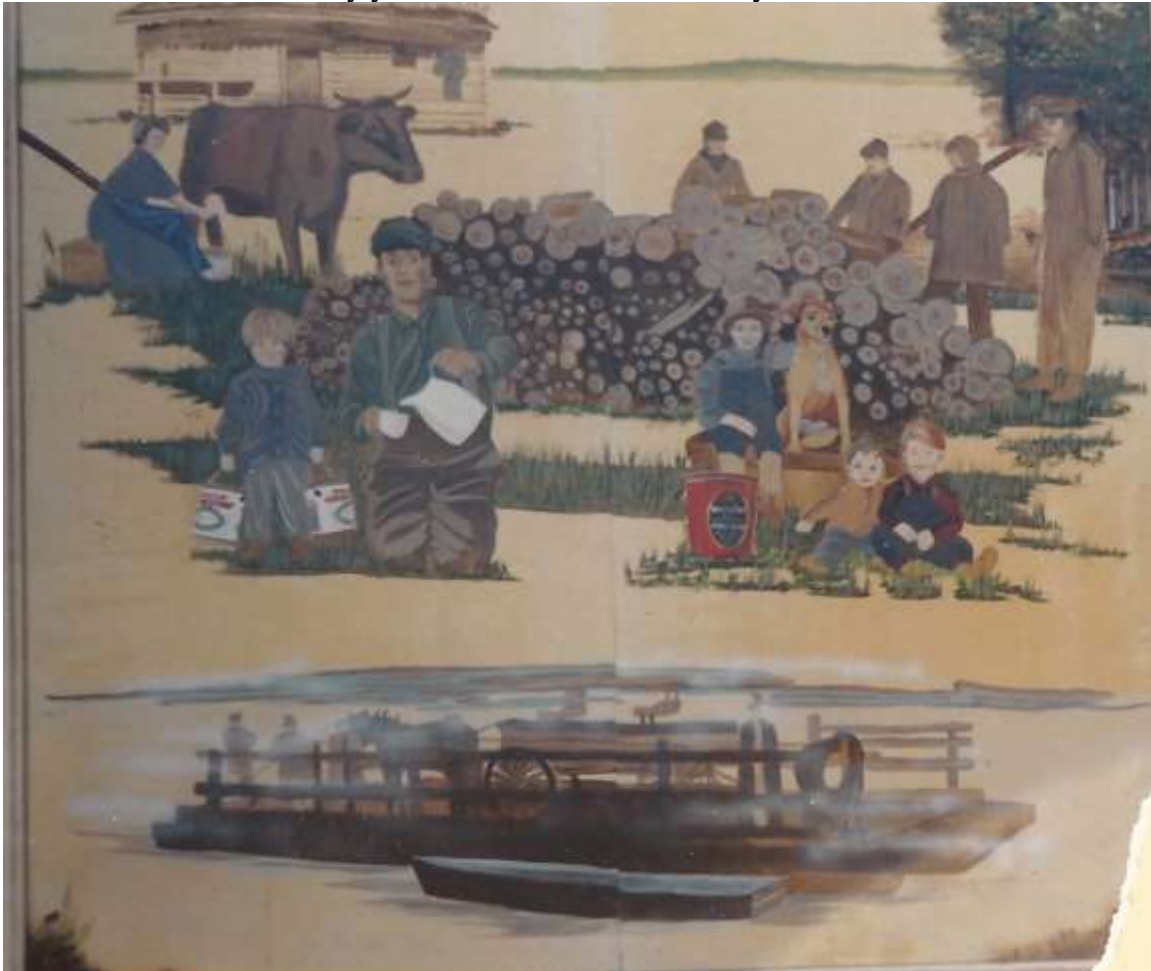
1 Many panels in the Elk Point Mural show how settlement developed

In the thriving community of Elk Point is located a within the County of St. Paul in the middle of farm fields and fields rich with with heavy crude oil. This town of 1400 is cradled among green rolling hills on the banks of the North Saskatchewan River. From furs and pemmican to grain and meat, to salt and oil, the Elk Point area has a colourful history that is showcased on a 100-foot-long Historical Mural depicting the people, places and events which have contributed to Elk Point's multicultural heritage located in a small park four blocks off Highway 41, on 50 Avenue. From tribal chiefs Pakan, Big Bear and Poundmaker, to the development of a modern community you will see Elk Point's history unfold in colour.