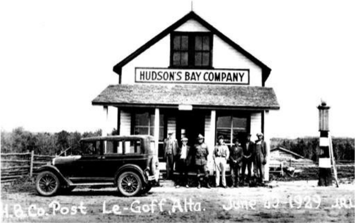
Hudson's Bay Company Post at Legoff, Alberta overlooking the Beaver River June 1929