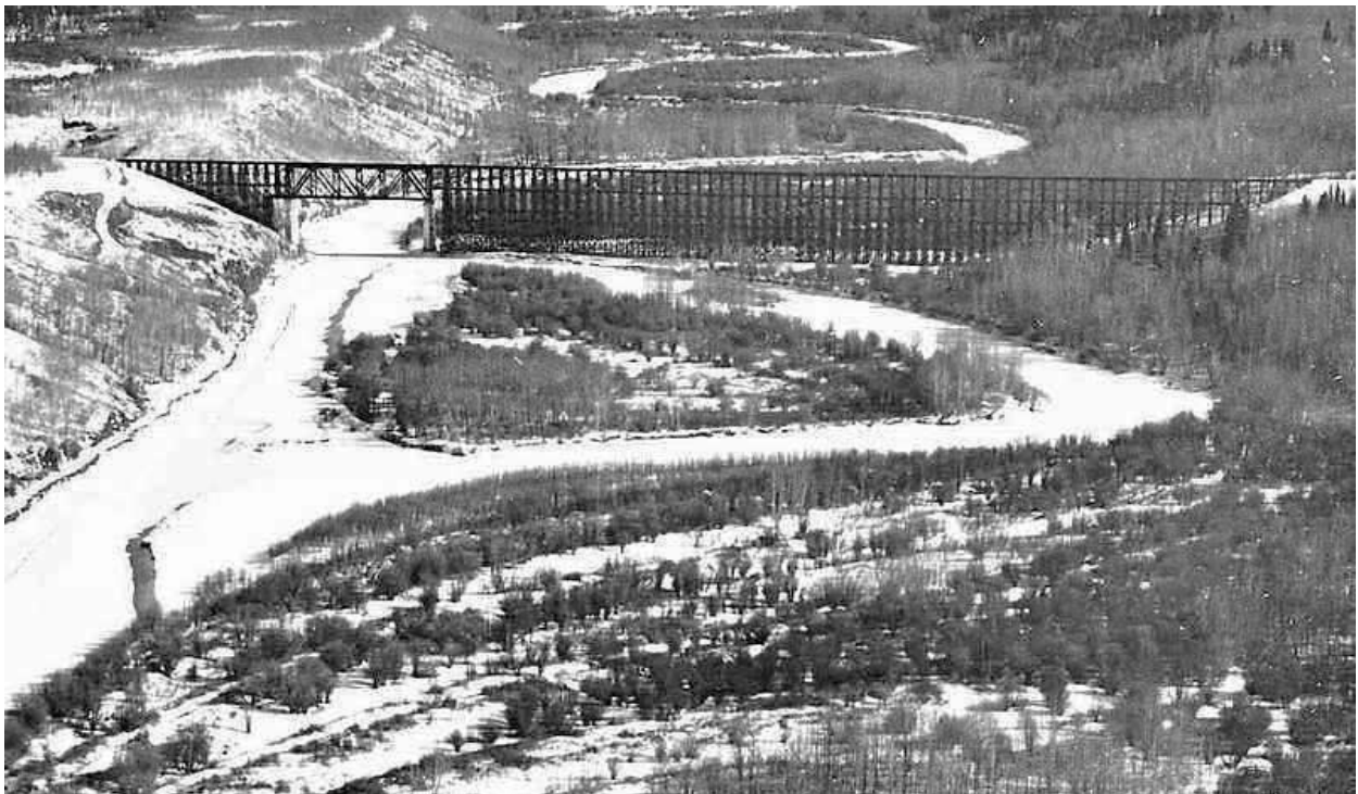
Completed Trestle 1950s

Up until 1952 the end of rail was at Beaver Station, so all local people had to go there to get their freight. With the building of CFB Cold Lake the trestle was completed and passengers and freight could go into Grand Centre.