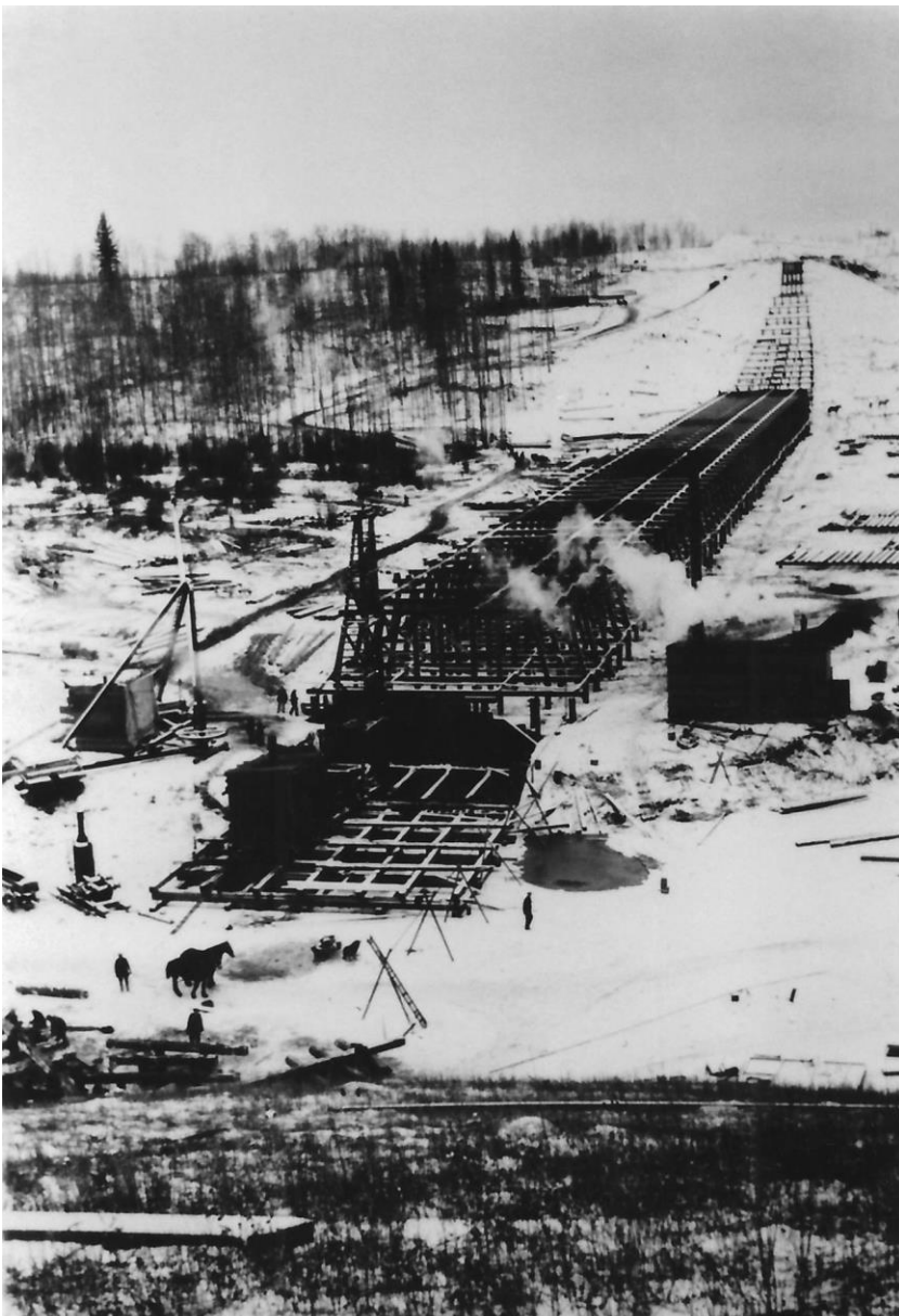
Beaver River train trestle construction at Beaver Crossing 1930

The coming of the railroad to Beaver Station or LeGoff in 1931 and then to Grand Centre in 1951 over the 102 foot the Beaver River Trestle was a big change for the entire Cold Lake area. Developments in the area affected the people of the surrounding communities. The opening of the Grand Centre creamery by Mr. Toppenberg, proved a boon to the many farmers who had no stable market for their dairy products.