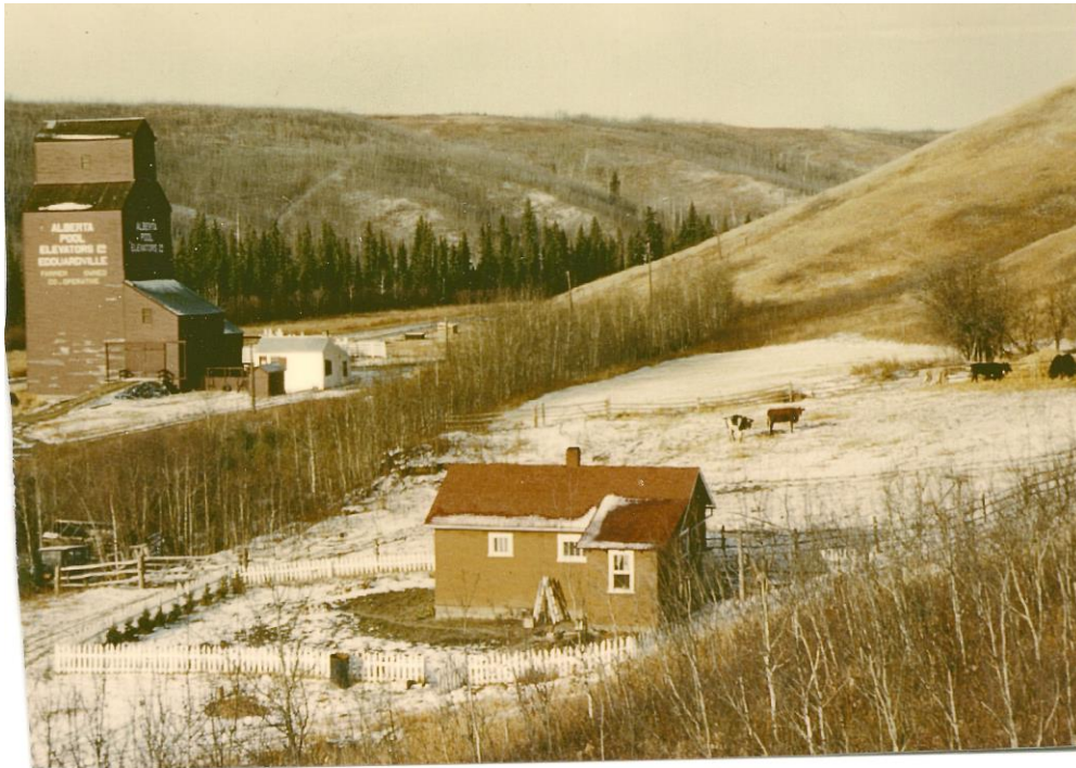
Edouardville in 1950s

About 1930 the Alberta Wheat Pool erected a grain elevator here. In 1931 the name of the station was changed to Edouardville to better identify it with the people living in the hamlet of St Edouard 3 miles north.