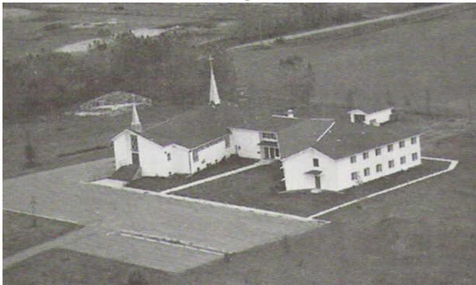
Diocesan Renewal Center in St Edouard

The community of St Edouard is three miles north of this site. In 1920 the parish decided to build the first church of St Edouard which was in use until the building of a new church in 1961.