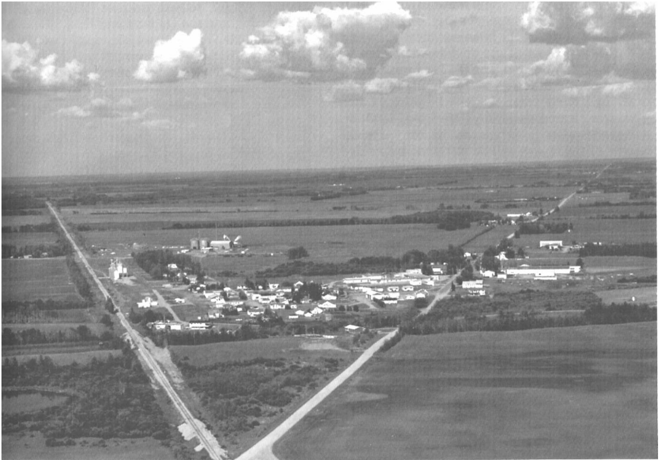
2 Aerial view of Mallaig in 1950s

In December of 1928, regular train service came to Mallaig. Three times a week the train came, freighting products, bringing mail and carrying passengers that relied on train service to go to Edmonton, Bonnyville or St. Paul. The train's whistle became a welcome regular sound.