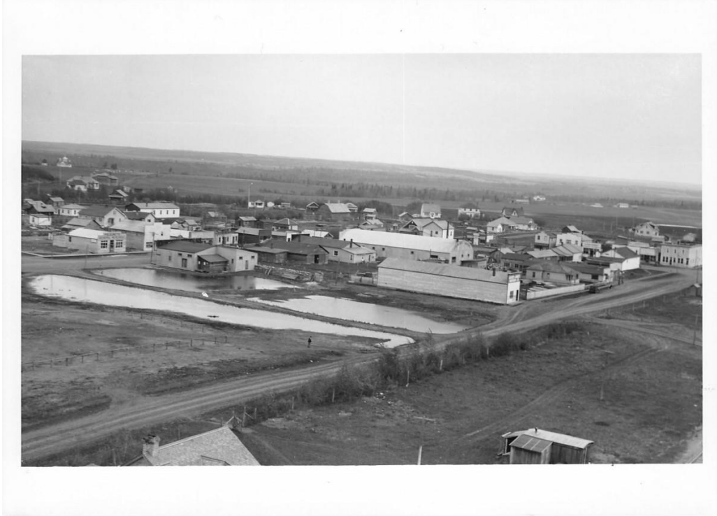
Smoky Lake 1940s