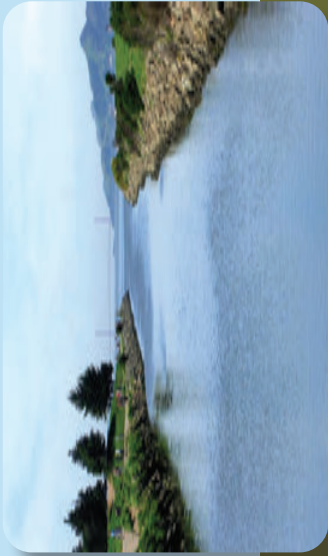
Richmond Inner Harbor