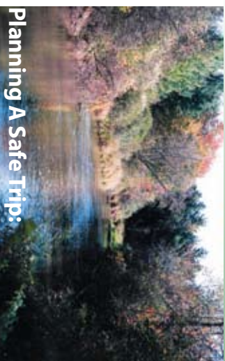
Planning A Safe Trip: