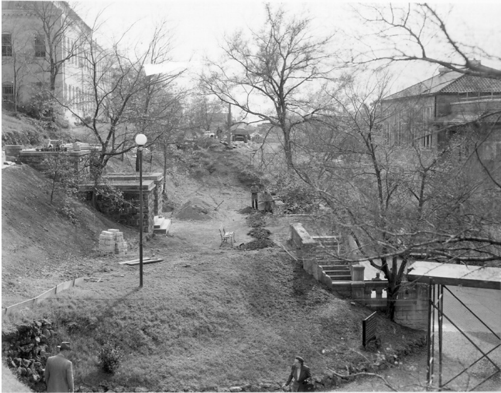
Obliterating the old service road

Both formalistic and naturalistic approaches were incorporated into the final landscaping plans. A formal bricked walkway was to be installed, but the earthen slopes along the walkway were to be retained. South of the formal entrance the promenade was