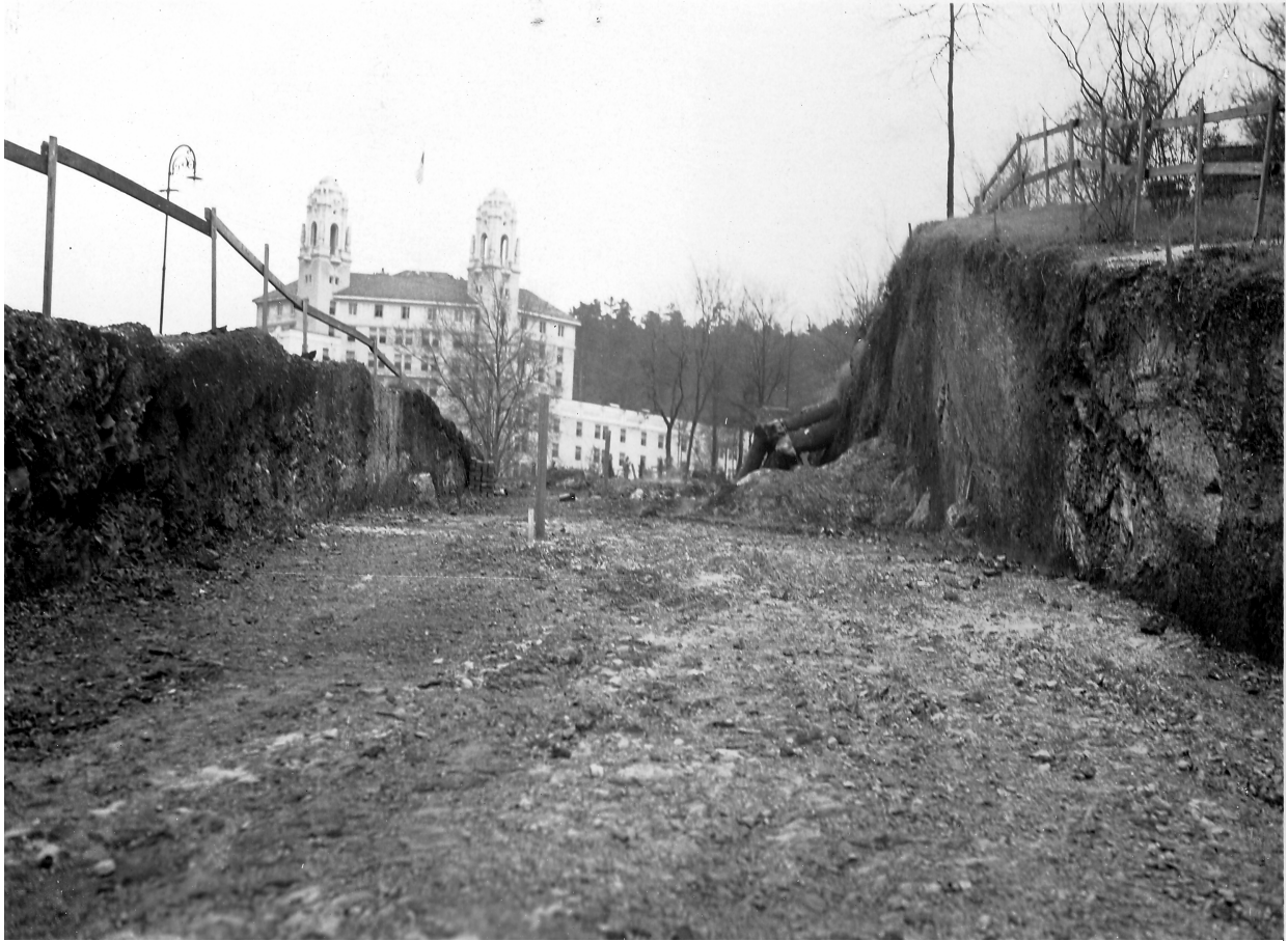
Grading the north end of the Grand Promenade; Arlington towers in distance.

from the ramp south of Stevens Balustrade to Fountain Street. The Noble Fountain was moved to its present location at the promenade's Reserve Street Entrance in July 1957, and on August 9, this entrance was at last complete. The completion of the north end of the promenade extension required the removal of the remaining portions of the old service road and the demolition of the 1893 superintendent's residence northeast of Arlington Lawn. The structure was razed in April 1958, and the site was landscaped. On July 25, 1958, the completion of promenade landscaping and lighting put the final touches on the Grand Promenade. On April 13, 1982 the Grand Promenade became a National Recreational Trail