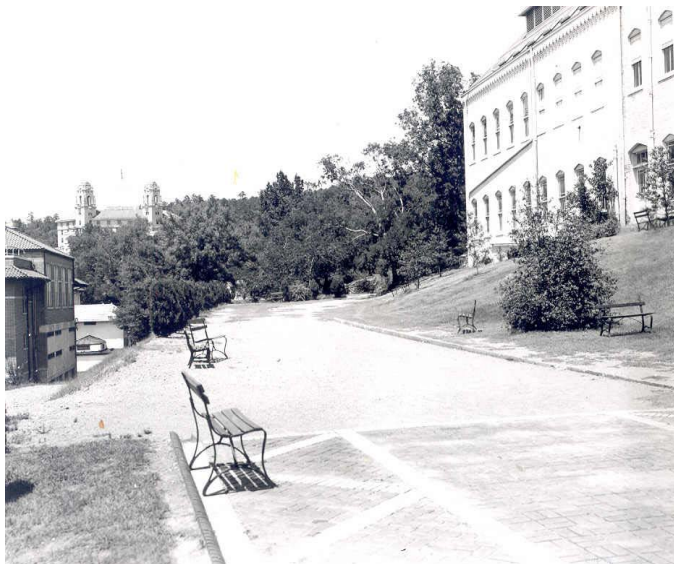
Completed brickwork on south promenade.

The Civilian Conservation Corps (C. C. C.) opened a work camp at Lake Hamilton in November 1939. Half of the resources were to be spent on improvements to Hot Springs National Park; the other half was to go for Game and Fish Commission work. One of their park projects was the improvement of mountain roads and trails, so they may have done some of the brickwork on the promenade. They left on March 15, 1942, and by August 1942 370 lineal feet of brickwork from the Reserve Street entrance to the ramp behind the Fordyce Bathhouse were completed. In December a drinking fountain was placed above the Reserve Street entrance.