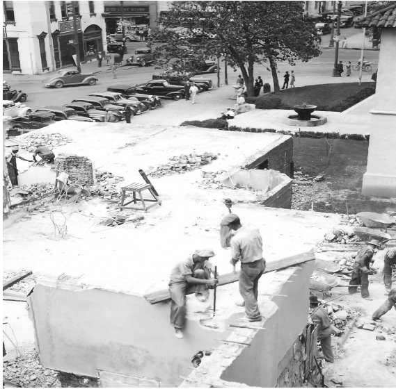
Razing the Imperial Bathhouse