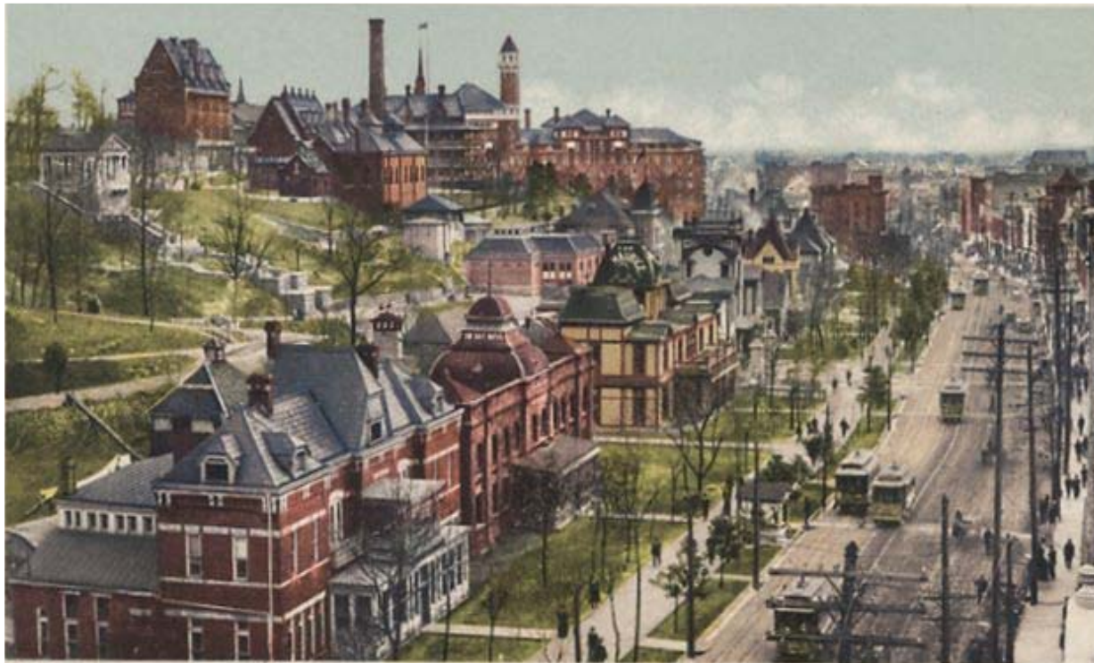
North end of Bathhouse Row in 1910: Note the service roads behind the buildings.

The Grand Promenade project was funded by the PWA in December 1933. Other projects also authorized that year were the construction of a new hot water line to the Government Free Bathhouse, a sewage disposal system at Gulpha Gorge campground, utility buildings (now the Maintenance Complex) on Whittington, an administration building, West Mountain Road reconstruction, and 27.5% of the funding for a city sewage disposal system. The promenade project caused some local opposition from people who thought the area involved should become either a parking lot or a bypass for downtown motor traffic. The park service had a very different view. As noted National Park Service Architect Charles Peterson put it, “The aesthetic purpose of this whole development is to provide an architectural transition from the multistoried structures across Central Avenue to the natural wooded slopes of Hot Springs Mountain.”