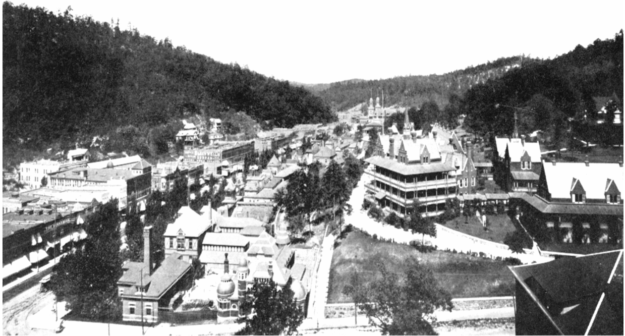
South end of Bathhouse Row and Army-Navy Hospital in 1910