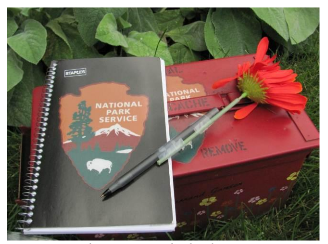
Every geocache contains a logbook to sign.

So far, so good. The eleven geocaches at the Roosevelt-Vanderbilt NHS went live at the end of May, and by the first week of August, people had logged over 300 finds. People come from all over, and the feedback is good. What is not to like? In addition to the usual challenges (and trinkets) of geocaching, and being guided to interesting places -- (Please stay on the trails! Remember that part about protecting our resources!) -- each cache includes some interesting information that you might not find out during your standard tour or the National Parks. And it's all right there, right along the trail.