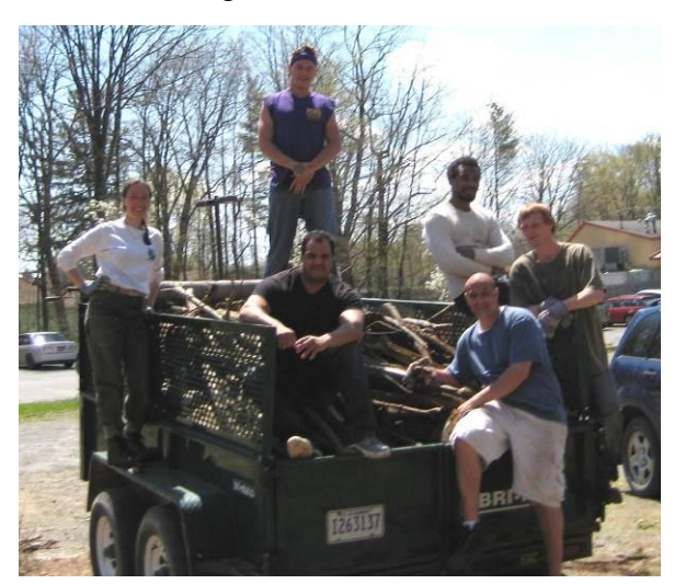
Daytop volunteers helped with cleanup of the Winnakee Preserve entrance

Phase one required the removal of years of accumulated storm debris from the area around the trailhead. It took volunteers from Daytop Village – with assistance from the Hyde Park Recreation Department and National Park Service – two days to clear nearly 20 tons of woody debris. The Town of Hyde Park Highway Department has generously donated fill material to grade the cleared area.