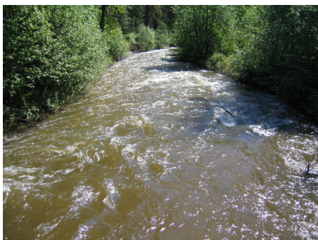
View #1: Sherman Creek