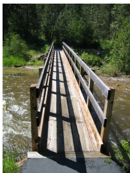
View #2: Bridge to Canyon Creek

History: In 1920 and for the next two decades logs were floated down a flume from the CCC Camp Growden, 2 miles west of this site, to the Columbia River near the Sherman Fish Hatchery to be cut for sash at the White Pine Sash Mill. Logs in a pond were released during Spring high water and followed down the flume where they would often jam up and need to be freed.