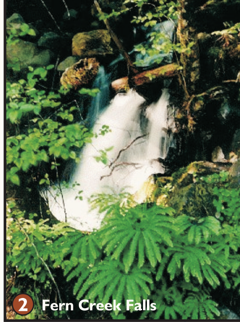
2 Fern Creek Falls

Standing on the footbridge will give you a good view of delightful Fern Creek Falls on one side and the North Umpqua Wild and Scenic River on the other.