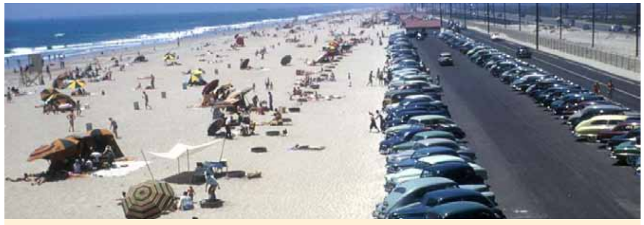
Huntington Beach, ca. 1950

The Acjachemen, conscripted into building Mission San Juan Capistrano in 1771 by Franciscan friars and Spanish settlers, were renamed Juaneños; the Tongva and Kizh who built the mission at San Gabriel in 1776 were then called Gabrielinos or Gabrieleños. These tribal groups were forced to abandon their villages and cultural traditions. They were converted to Christianity and labored at such trades as adobe brickmaking and grape growing for the missions.