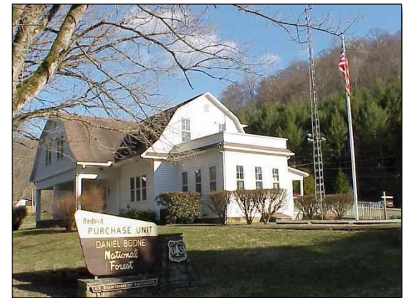
Redbird Ranger Station, 2008