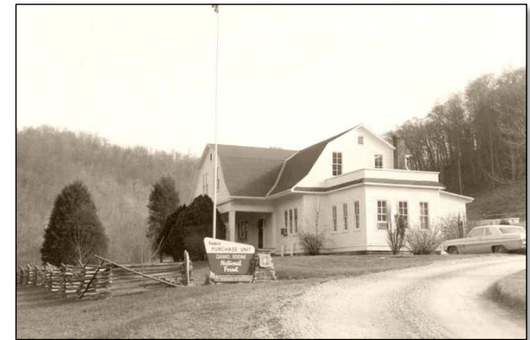
Redbird Ranger Station, 1968