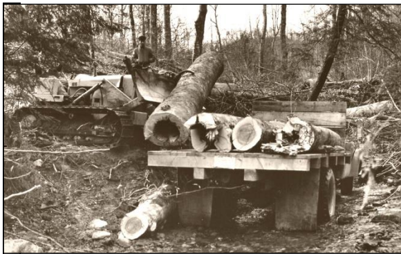
Red Bird Timber Company