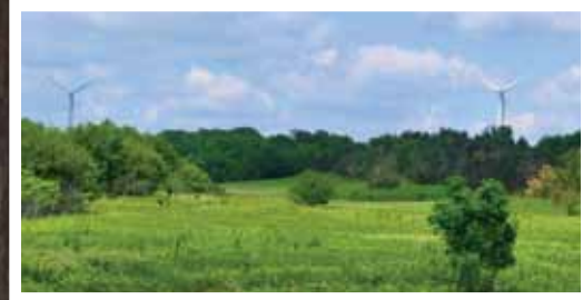
Winding through the peaceful countryside, trail users will come upon a variety of beautiful sights including a wind farm and sweeping fields of wildflowers.