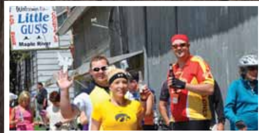
There are several rest stops along the way, from parks to benches to bars and restaurants. Each community along the trail welcomes visitors with small-town Iowa hospitality.