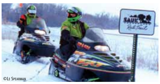
The multi-purpose trail offers something for everyone all year long. Snowmobiling and cross country skiing are popular activities during the winter.