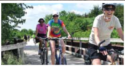
While there are some hilly sections around Swan Lake, a majority of the Sauk Rail Trail was built on abandoned railroad beds which creates flat terrain for an easy ride.