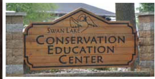
Naturalists provide environmental education opportunities along the trail. Group activities can be scheduled by contacting the Carroll or Sac County Conservation offices.