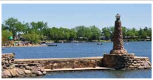
Trailgoers can find many historic landmarks along the trail, including a historical farmstead in Swan Lake State Park, a restored 1905 train depot in Breda and the iconic stone piers (above) on Black Hawk Lake in Lake View.