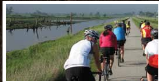
Wildlife viewing opportunities are prevalent along the trail. Traveling through the Black Hawk Marsh (above), Hazelbrush Wildlife Area and along the Sauk Bluebird Trail makes you feel like one with nature.