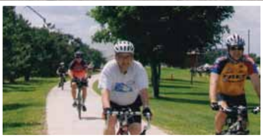
There are many routes beyond the Sauk Rail Trail for riders to explore, such as the community/park trail system in Breda (above) and the Black Hawk Lake trail in Lake View.