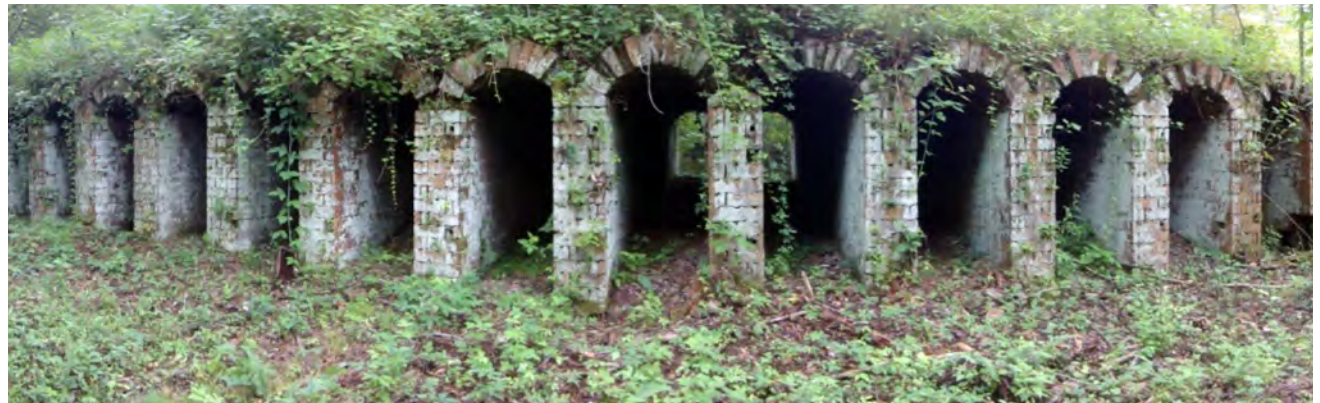
Photo: Remains of Belgian coke ovens.

"Promoting and applying management for the sustainable use and protection of Ohio's private and public forest lands."