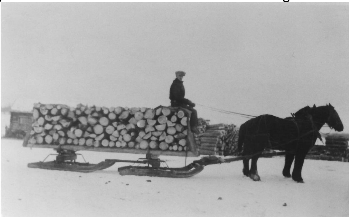
Yearly tithe paid with cut wood to heat St. Dominic Church 1940's

A flourishing community grew in Cold Lake (now Cold Lake North) based on tourism and commercial fishing.