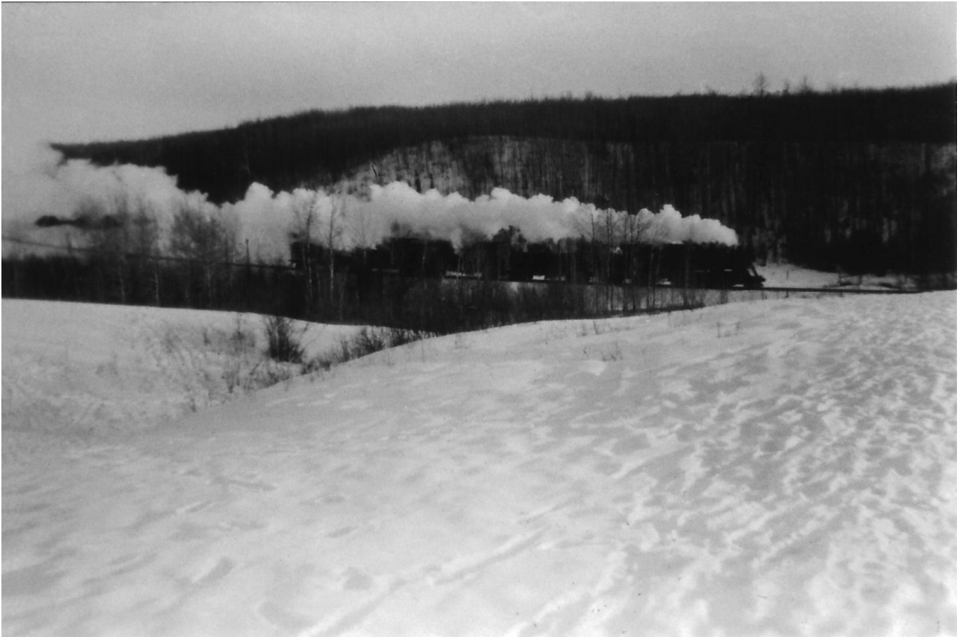
Coal fired steam train at Beaver Crossing circa 1945

The continual process of change during has brought Cold Lake to its present stage of development. The growth of Cold Lake has been from its natural attributes, the forests, fish, agriculture and oil. Cold Lake did not grow in isolation but flourished as a community with the surrounding countryside.