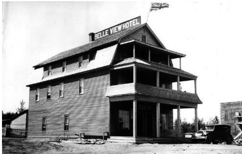
Bellview Hotel 1926

After 1905 early pioneers began to adapt to the Cold Lake climate and reaped the benefits. Agriculture could be supplemented by commercial fishing. For a while an active tourist promotion tried to bring early tourists to the shores of Cold Lake.