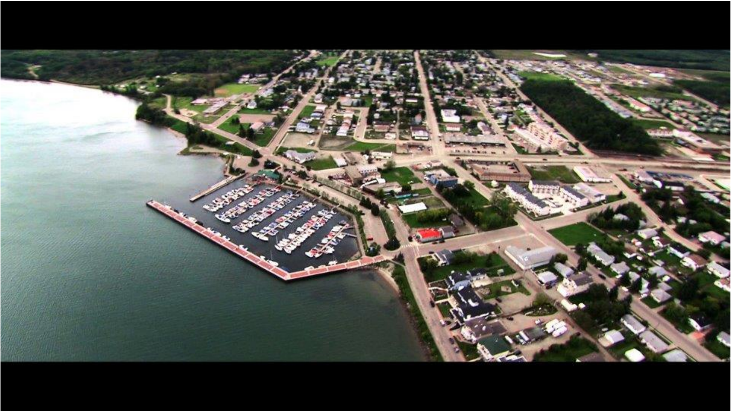
Cold Lake North

In 1999? The City of Cold Lake resulted from the amalgamation of Grand Centre, Cold Lake and Medley often known as Cold Lake South, Cold Lake North and Cold Lake East.