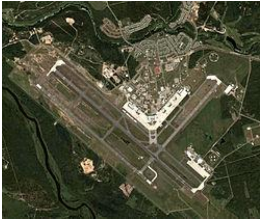
4 Wing - Cold Lake

The construction and arrival of the Cold Lake Air Base in 1952 was the next great important event the area. Businessmen benefited because of increased business and the many farmers and residents found work and they were at last paid a set wage for their services. The main runway and two hangers were usable by spring 1954. The work at the Base was continued for many years as new facilities were added. A school started in 1954, roads paved in 1955, an Airbase hospital in 1954 and in 1977 the Primrose Bombing Range was added.