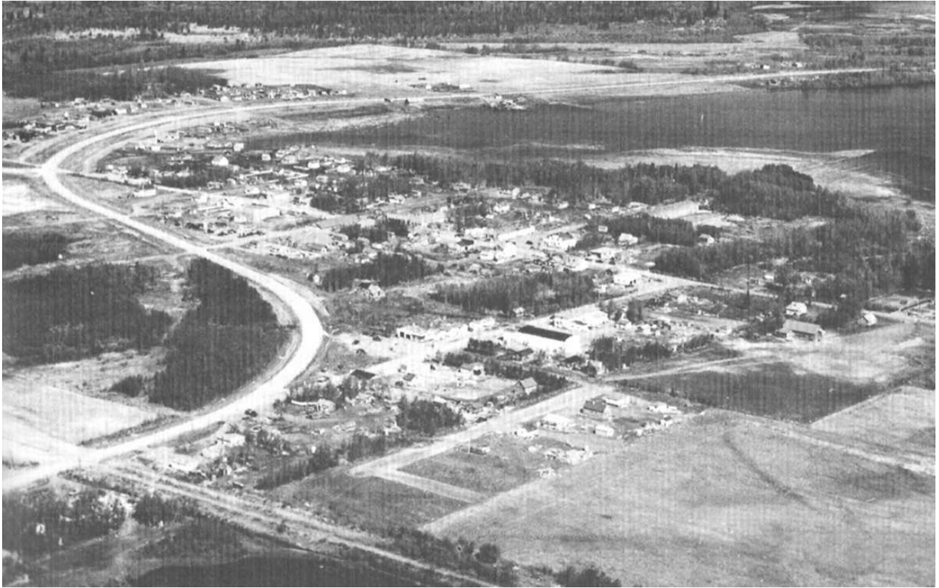
Grand Centre 1955

In 1980 the Esso Resources development began another era of growth for the area.