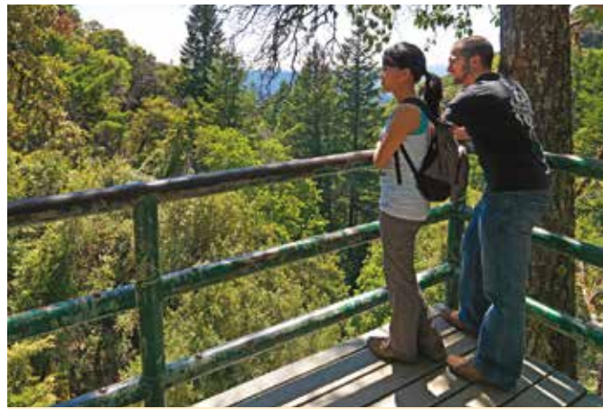
Observation deck at Castle Rock Falls

These complex patterns form with repeated exposure to erosion from blowing sand, water, and chemical and physical changes over eons.