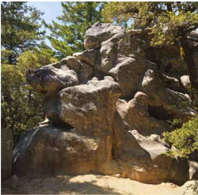
Castle Rock—one of many sandstone outcrops in the park

Native people hunted deer, pronghorns, and bears that were attracted to the area's abundant vegetation. Today's park lies within a major trail system that was used to move resources inland from the coast.