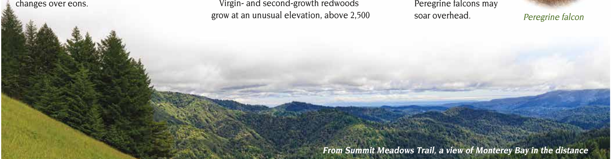
From Summit Meadows Trail, a view of Monterey Bay in the distance