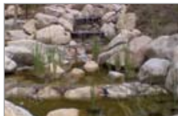
Grotto and Waterfall