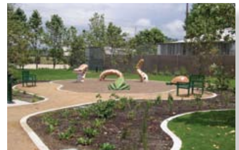
Marsh Park-Los Angeles River