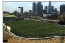
FIFA-regulation Soccer Field