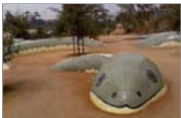
Children's Adventure Area