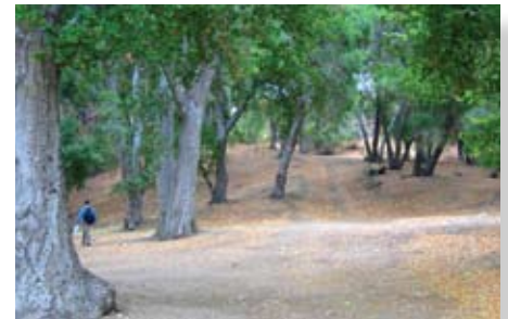
Whitney Canyon Park-Santa Clarita