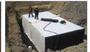
Cistern Stores 20,000 gallons of rainwater for irrigation.