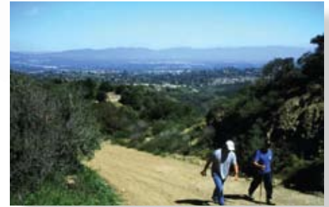
Wilacre Park-Studio City