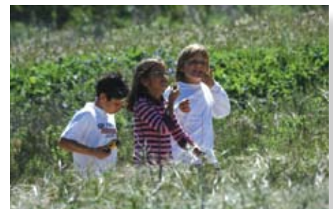
Santa Monica Mountains