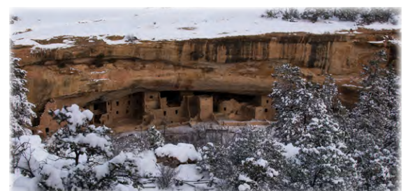
Spruce Tree House from overlook

*It is a 45- to 60-minute drive from the park entrance to Spruce Tree House and the museum.