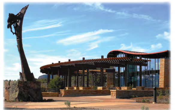
Welcome Plaza, Mesa Verde Visitor and Research Center

*Please stop by the the Visitor and Research Center to pay your entrance fee and support your parks.