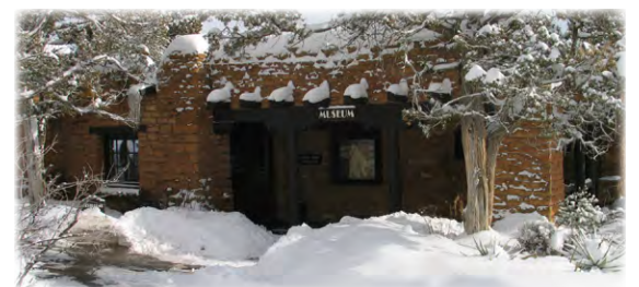
Chapin Mesa Archeological Museum

Chapin Mesa Archeological Museum and Store will help you gain insights into the lives of the Ancestral Pueblo people. The museum is located 20 miles (33 km) south of the park entrance. A 25-minute park video is shown every half hour or upon request. Open daily except Thanksgiving, Christmas, and New Year's Day.