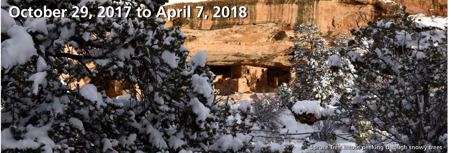
Spruce Tree House peeking through snowy trees