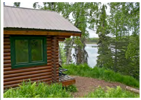
James Lake public-use cabin