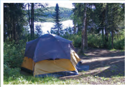
South Rolly Lake campground