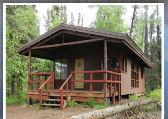
Public-use cabin #1 at Red Shirt Lake