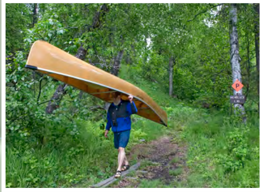
Big Noluck Lake