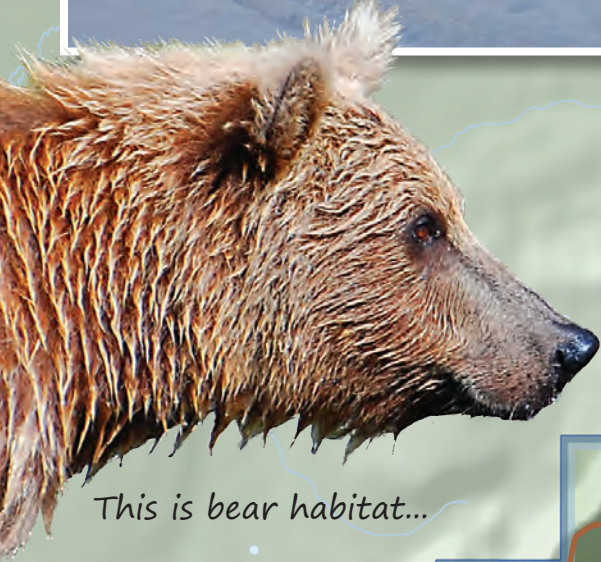
This is bear habitat...