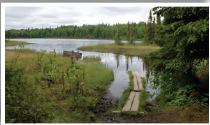
Little Noluck Lake portage

Under a blanket of snow, the rolling topography of Nancy Lake SRA is ideal for cross-country skiing, snowmachining, and dog mushing. With nearly 40 miles of maintained trails and lots of opportunities for backcountry snowshoeing, ice fishing, snowmachining and skiing, Nancy Lake SRA is a superb winter playground.