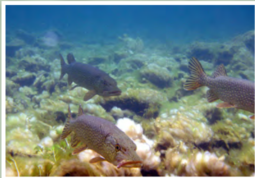
Northern pike are easy to catch and they put up a decent fight. They are considered an invasive species in this area, so catch and eat all you want and consider it a favor to the trout populations.

You can also access the Nancy Lake canoe trails via the Little Susitna River. From the canoe launch at mile 57 of the Parks Highway in Houston, it takes four to five hours to reach the Skeetna Lake Portage. The river is fairly easy traveling, but some canoeing experience is a plus. Watch for the sign marking the portage and use caution when meeting powerboats.