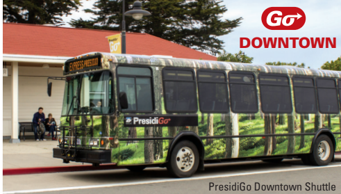
PresidiGo Downtown Shuttle