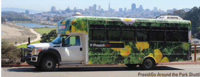
PresidiGo Around the Park Shuttle

PresidiGo AROUND THE PARK shuttle routes are always free and run two continuous 30-minute loops. Both routes originate at the Presidio Transit Center (215 Lincoln Boulevard) and connect with MUNI and Golden Gate Transit. They operate on a weekend schedule on federal holidays.