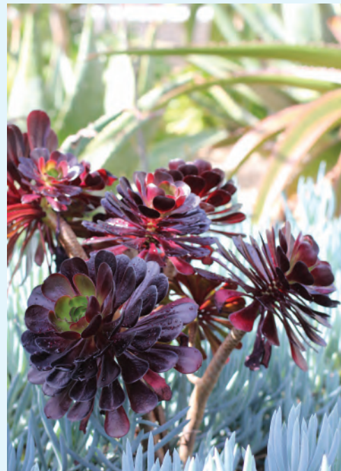
Pictured: Aeonium Arboreum Zwartkop