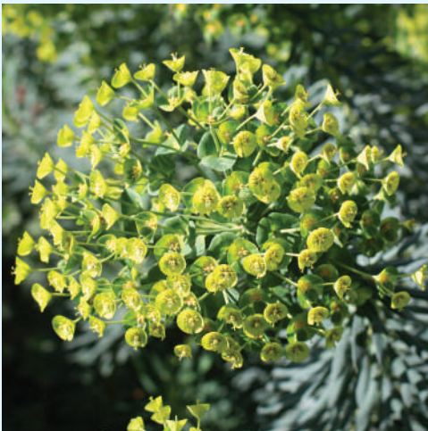
Pictured: Euphorbia Characias Wulfenii