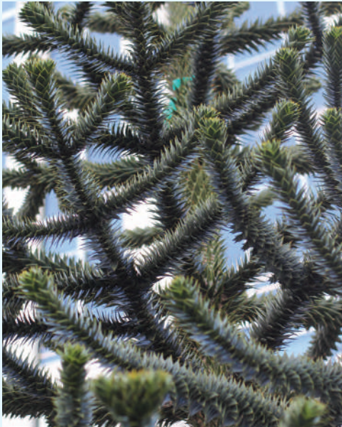
Pictured: Araucaria Araucana