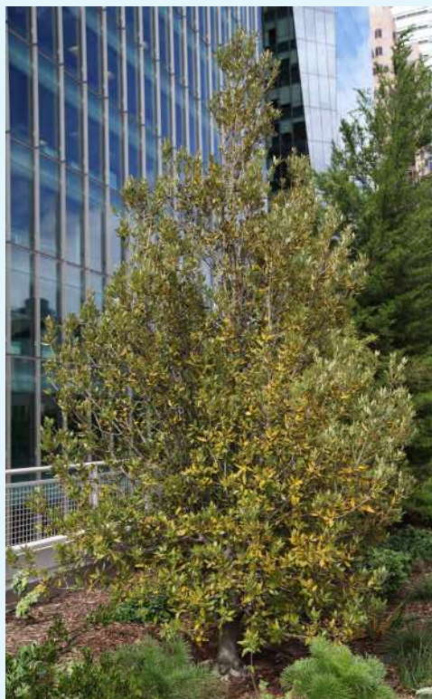
Pictured: Heteromeles Arbutifolia