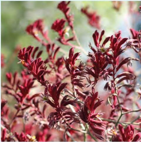
Pictured: Anigozanthos 'Bush Sunset'