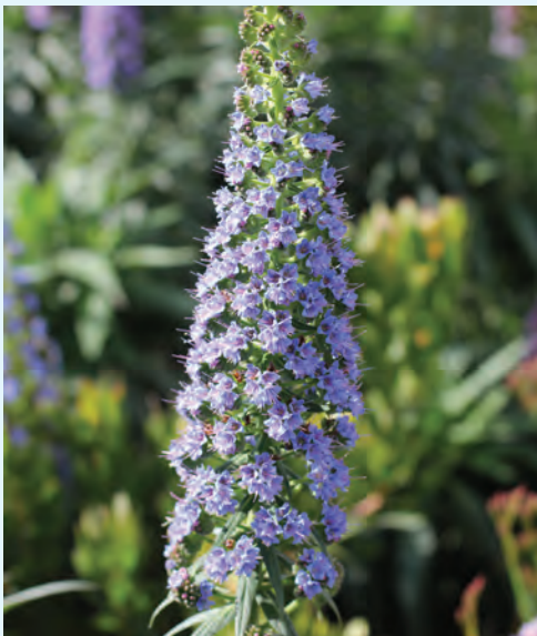
Pictured: Echium Candicans

The park and all plantings were designed by PWP Landscape Architecture (Peter Walker & Partners).