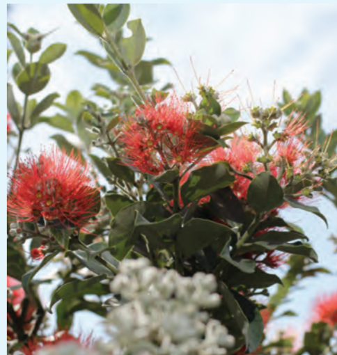
Pictured: Metrosideros Excelsa