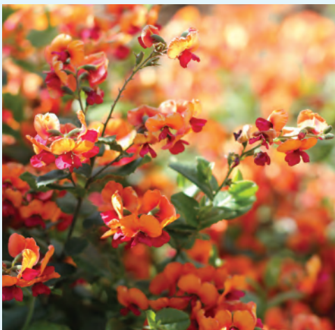
Pictured: Chorizema 'Bush Flame'