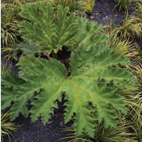
Pictured: Gunnera Manicata