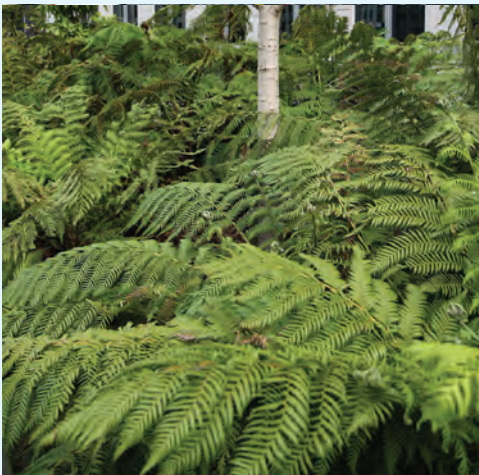
Pictured: Cyathea Cooperi