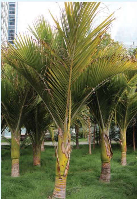
Pictured: Rhopalostylis Baueri