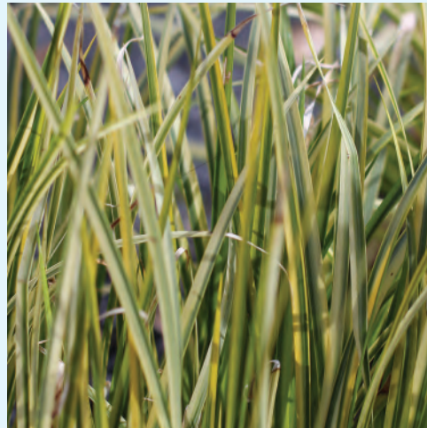
Pictured: Acorus Gramineus 'Ogon'