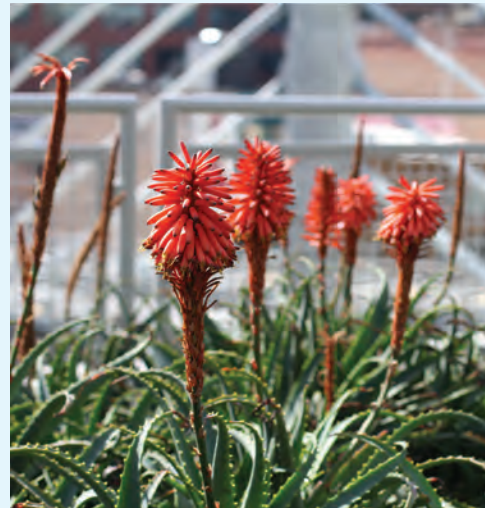
Pictured: Aloe Arborescens