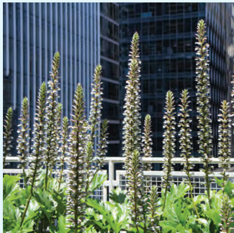
Pictured: Acanthus Mollis