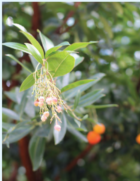
Pictured: Arbutus 'Marina'

WINNIFRED GILMAN BLUE SAGE Salvia Clevelandii 'Winnifred Gilman'