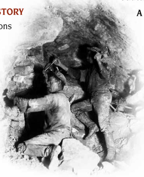
Mining for minerals

Only small mining operations preceded California's 1848 gold discovery in Coloma. Gems (precious or semi-precious stones) such as turquoise, garnets, and even diamonds had been found in Amador, Butte, El Dorado, Nevada, and Trinity counties. Silver, copper, mercury, and other minerals had previously been mined in California.