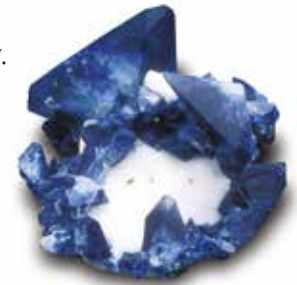
Benitoite: California State gemstone

California history. Proceeds support the park's nonprofit association, which funds educational and interpretive programs.