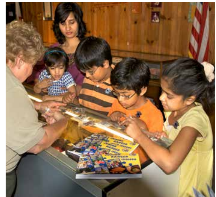
Junior Rangers earn their badges.

The State's initial collection—1,327 specimens donated by the California State Geological Society—was first displayed in the State Mining Bureau's San Francisco offices. Ore specimens and donations were constantly added. Between 1880 and 1983, the collection moved five times. The Ferry Building on the Embarcadero housed the collection until 1983 when building renovations forced yet another move.