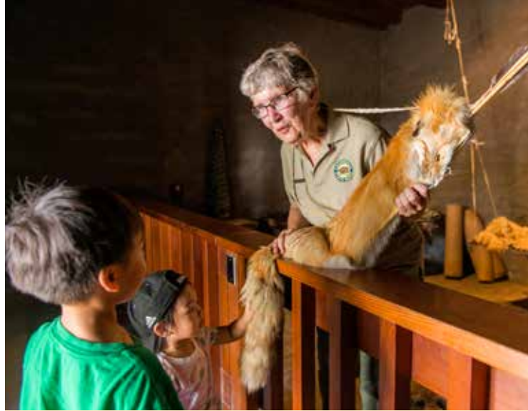
Students examine a foxskin arrow quiver.

The only remaining original mission building is the adobe that the Indian