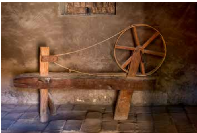
Primitive spinning wheel on exhibit

Another blow to the weakened Santa Cruz Mission occurred in 1818 when French pirate Hippolyte Bouchard—known for plundering