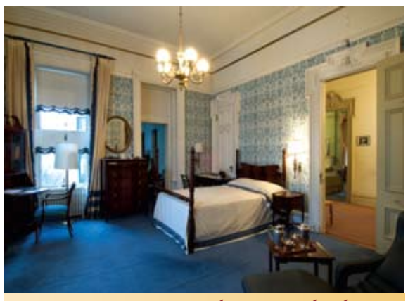
The master bedroom