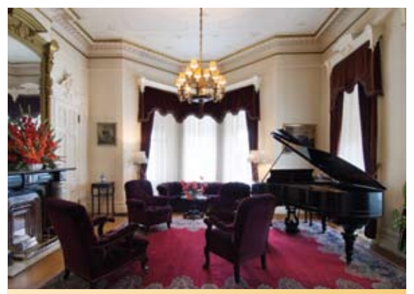
The Gallatin library, now the music room