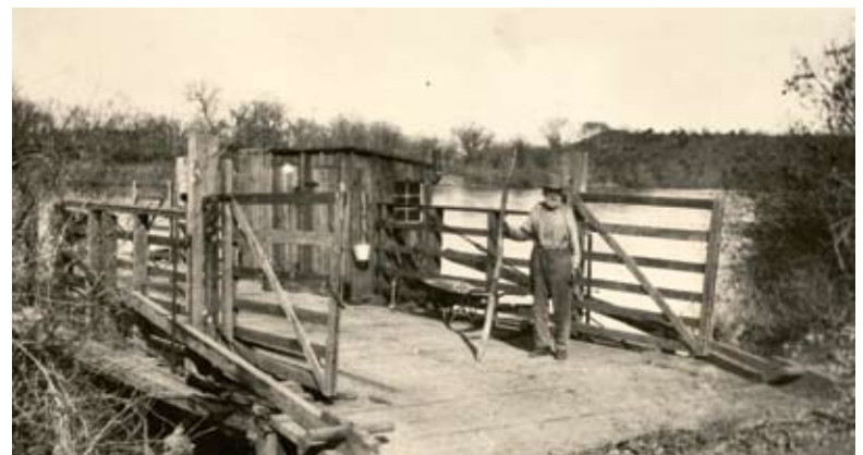
Sacramento River ferry operator, late 1800s

Like William B. Ide, the pioneer owners of the property originally called Bluffton Ranch arrived in California with visions of opportunity. Faced with challenges, they used their location near the California-Oregon Road and the Sacramento River to form communication and transportation connections to the outside world. Pack trains, horsemen, miners on foot, ox teams, covered wagons and stagecoaches moved up and down the valley, and steamboats moved along the river. In 1862 a ferry crossing was built on the property. The park today reflects the hard work of those pioneers who lived in mid-19 th -century California.