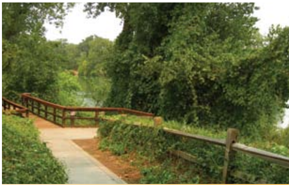
Cottonwood Trail along the Sacramento River

In 1883 later explorers unwittingly brought a malaria epidemic, decimating the native population. Though the explorers later took over Nomlaki lands, Nomlaki descendants still live in Northern California today.