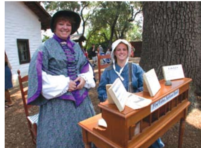
Volunteers interpret pioneer California life.

An accessible picnic table on a concrete pad is in the shaded picnic area. Accessible parking and restrooms are nearby.